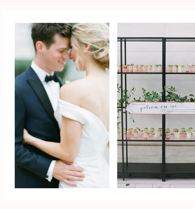
Follow Style Me Pretty on INSTAGRA